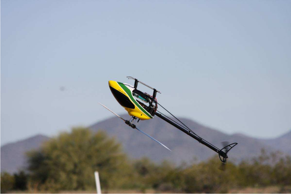
Rotor Wash 11