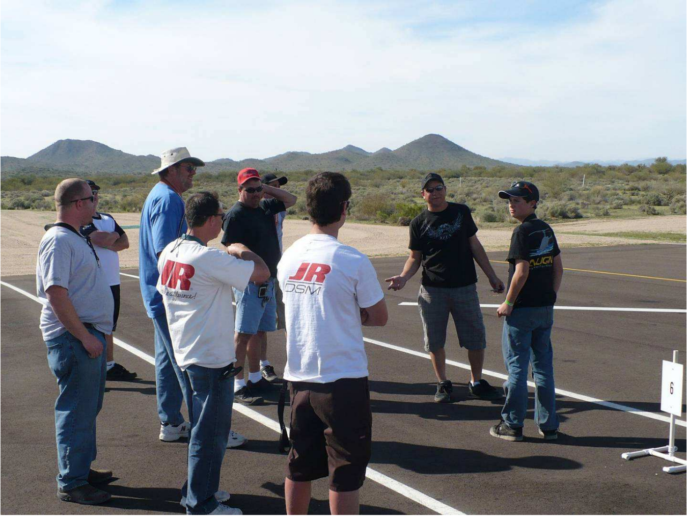
Rotor Wash 6